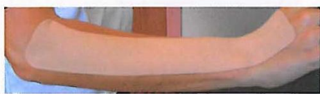
Technique used to assist Forearm Extensors